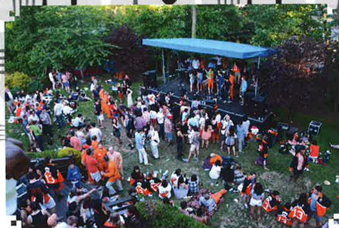
Scenes from Reunions 2014, including an outdoor performance by Sensemaya Afrobeat All-Stars (featuring many Terrans onstage)

We've continued the time-honored Terrace tradition of hosting incredible musical performances this semester. Here are some highlights. We kicked off the semester with a ridiculous lawnparty. First TEEBS hit us with a hypnotizing beats set. Then BREAK SCIENCE took the stage and blew up the scene with their one of a kind fusion of live and electronic elements. In mid September, LA producer THRIFTWORKS flew into town to lay down some wonky beats. He brought the house down with an all original set of some of the zaniest electronic music known to mankind. Later that month, VULFPECK returned to Terrace, and this time we were a stop on the legendary SLEEPIFY tour. They wowed us with their never ending funk in celebration of their ingenious exploitation of Spotify's royalty system. In October, Bulgarian house producer KINK made the trip to Terrace to put on an incredible live electronic performance. He hit us with freshly crafted acidic beats for upwards of 4 hours. Massachusetts trio ELDER came on down to effectively melt the faces of everybody in the club. They brought the heaviest psychedelic rock you could possibly imagine, throwing the house into a delirious, head-banging haze. And one of the most enjoyable shows all semester took place when Chicago band SIDEWALK CHALK arrived in November to share their delicious fusion of funk and hip-hop and their fun-loving attitude. The house pulsed with their never-ending supply of good vibes. Here's a full list: